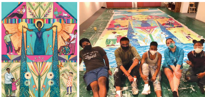
Left: "Fountain of Life" mural that will be housed at Cincinnati Children's new Critical Care Building. Right: Youth apprentices who worked on the mural. Three are from Avondale.